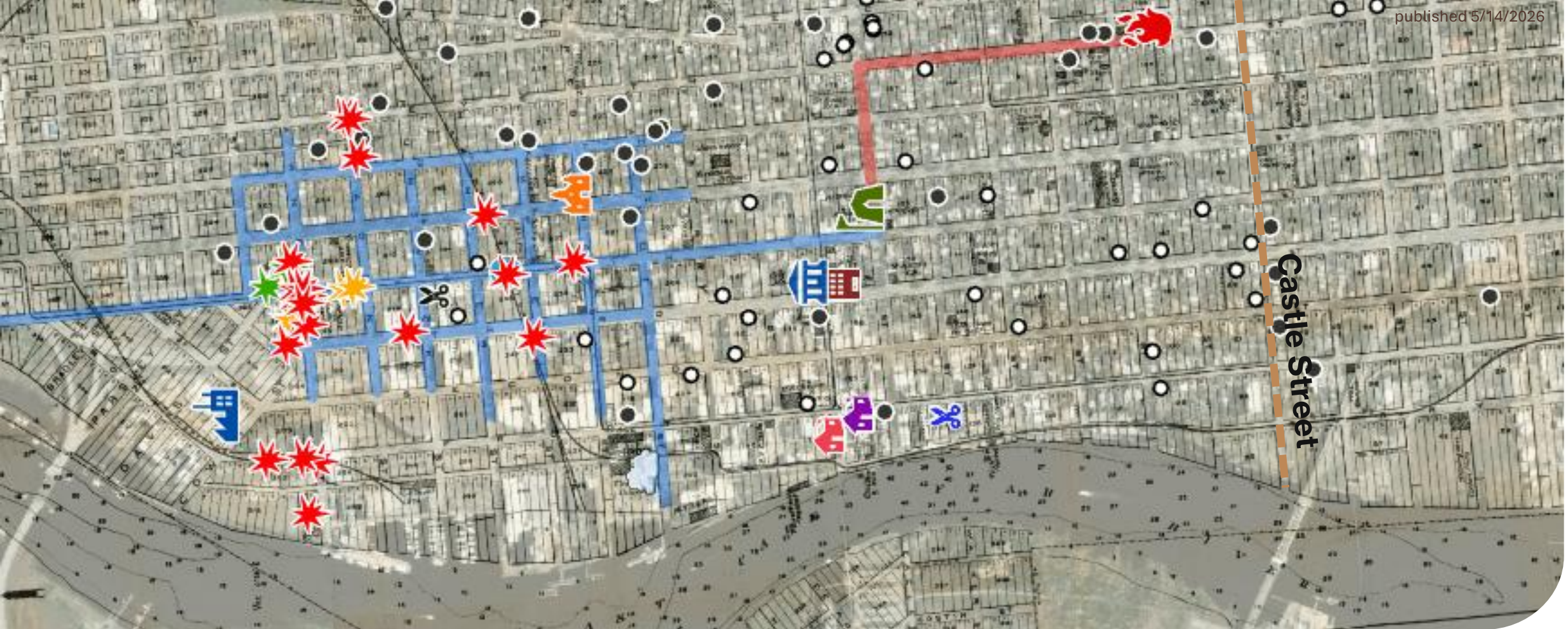
1898 COUP INCIDENT MAP